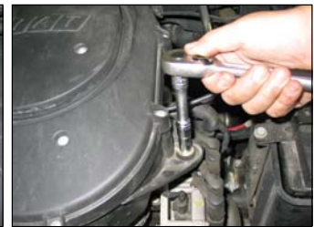
Fig. # 4