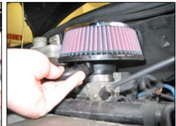
Fig. # 8