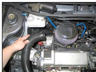
Fig. # 10