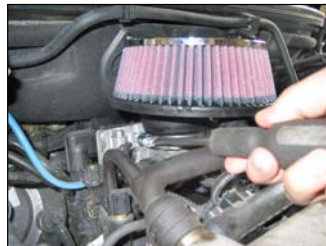
Fig. # 7