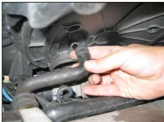
Fig. # 5