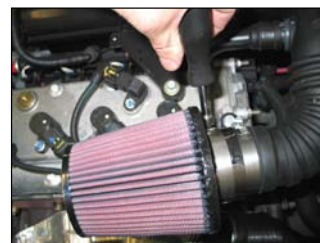
Fig. # 12 Page 2 of 2