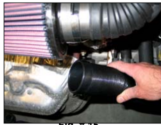
Fig. # 15