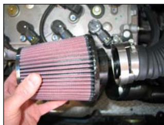
Instruction Sheet No.A2054-614