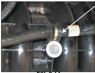
Fig. # 13