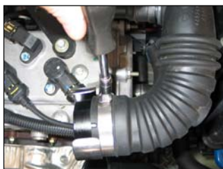
Fig. # 9