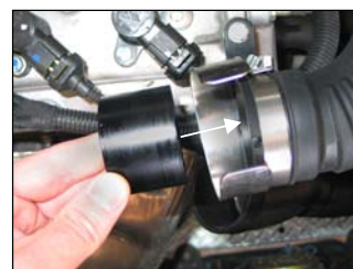
Fig. # 8