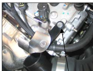
Fig. # 7