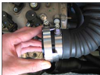
Fig. # 10