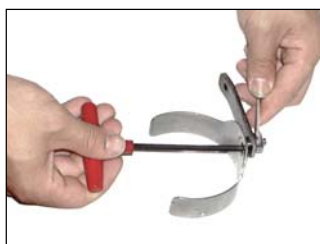
Fig. # 6