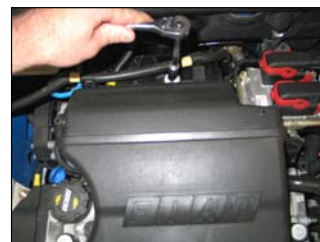
Fig. # 4