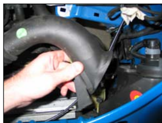
Fig. # 3