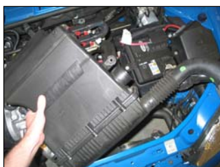
Fig. # 5