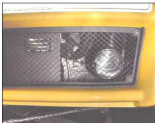
Fig. # 9