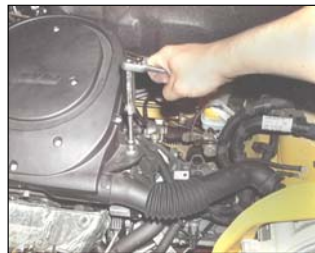
Fig. # 3