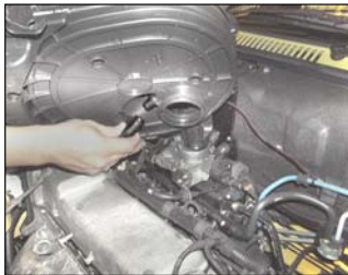
Fig. # 5