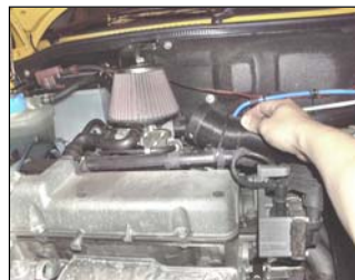
Fig. # 10