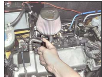
Fig. # 8