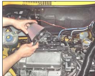
Fig. # 7