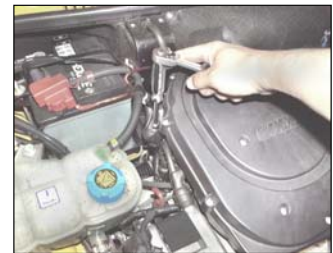
Fig. # 4