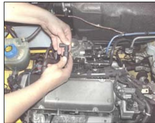
Fig. # 6