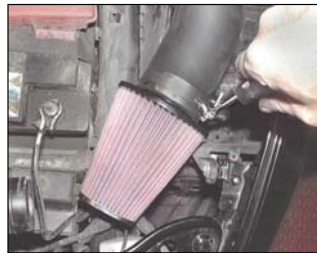
Fig. # 11