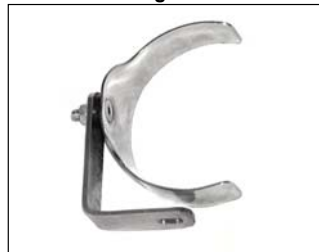
Fig. # 6