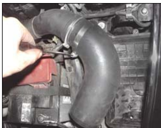
Fig. # 9