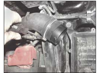
Fig. # 8