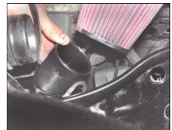
Fig. # 12