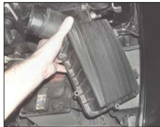
Fig. # 3