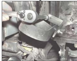
Fig. # 7