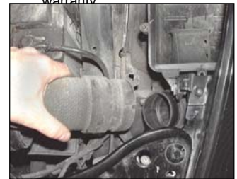
Fig. # 4