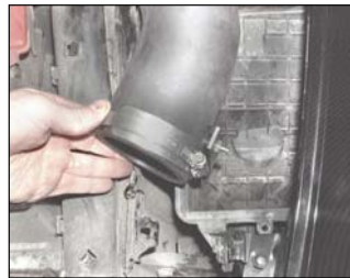
Fig. # 10