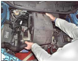
Fig. # 5