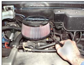
Fig. # 10