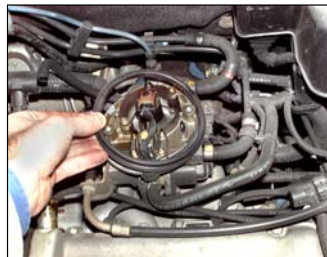
Fig. # 7