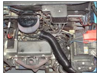
Fig. # 12