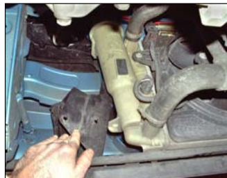
Fig. # 11