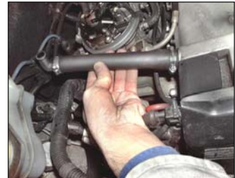
Fig. # 8