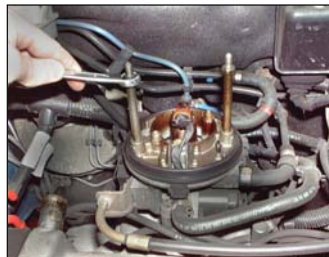
Fig. # 6