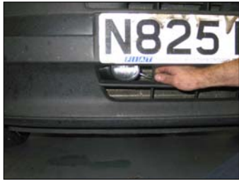
Fig. # 17