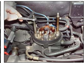
Fig. # 8