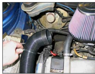
Fig. # 18