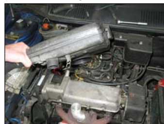
Fig. # 6