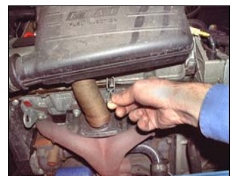
Fig. # 4