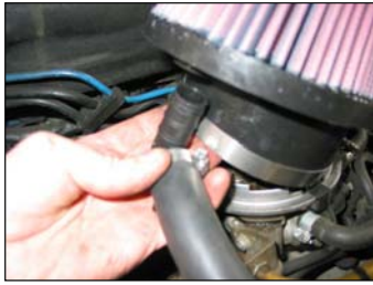
Fig. # 13

Fiat Punto 1.1L / 1.2L 8v 4Cyl. Spi Mar'94–May'99