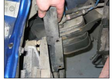
Fig. # 16