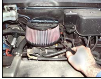
Fig. # 14