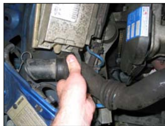
Fig. # 3