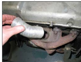
Fig. # 7