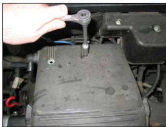
Fig. # 5