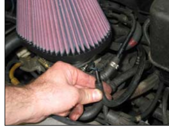
Fig. # 15